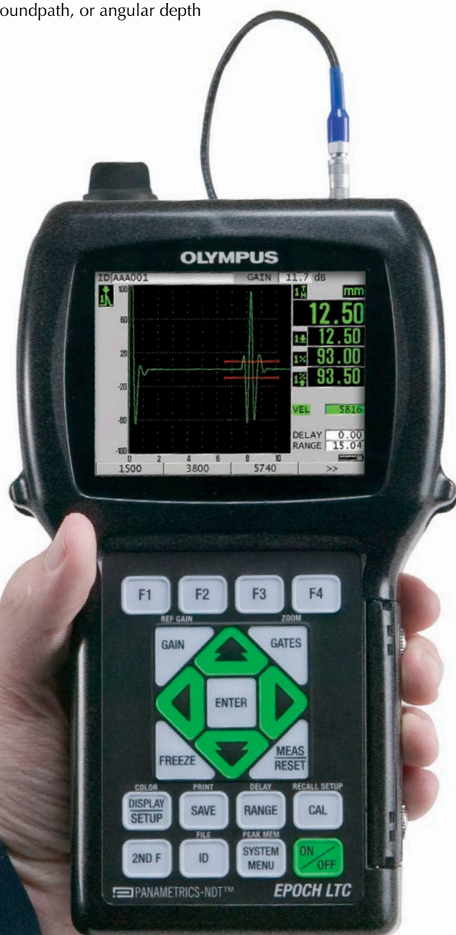
Hand strap can be moved for use with left or right hand

Four custom function keys allow operators to select preset values for instrument configuration parameters.